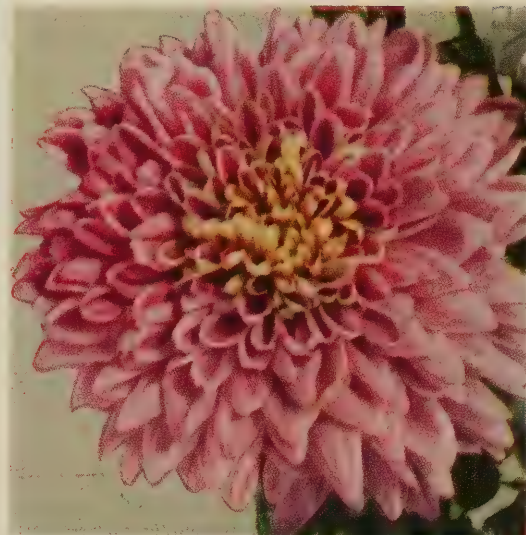
TIME. 75c each; 3 for $2.00

6 Glorious MUMS A selection of favorites that come into glorious bloom in early October. It is true that some of the later varieties are of the highest quality. 6 Sure-to-Bloom Plants (1 of each pictured) $3.70